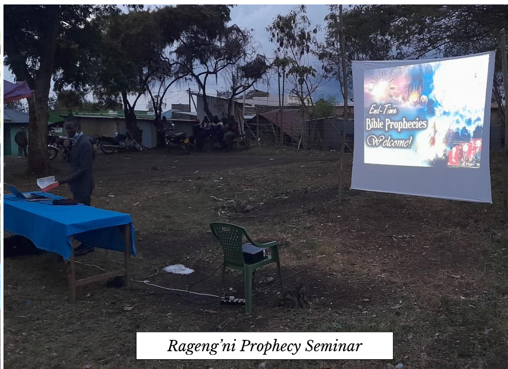
Rageng'ni Prophecy Seminar