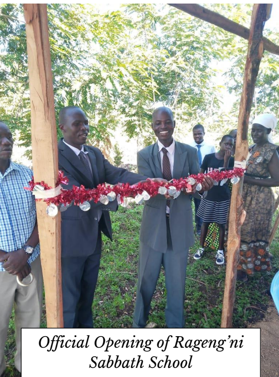
Official Opening of Rageng'ni Sabbath School