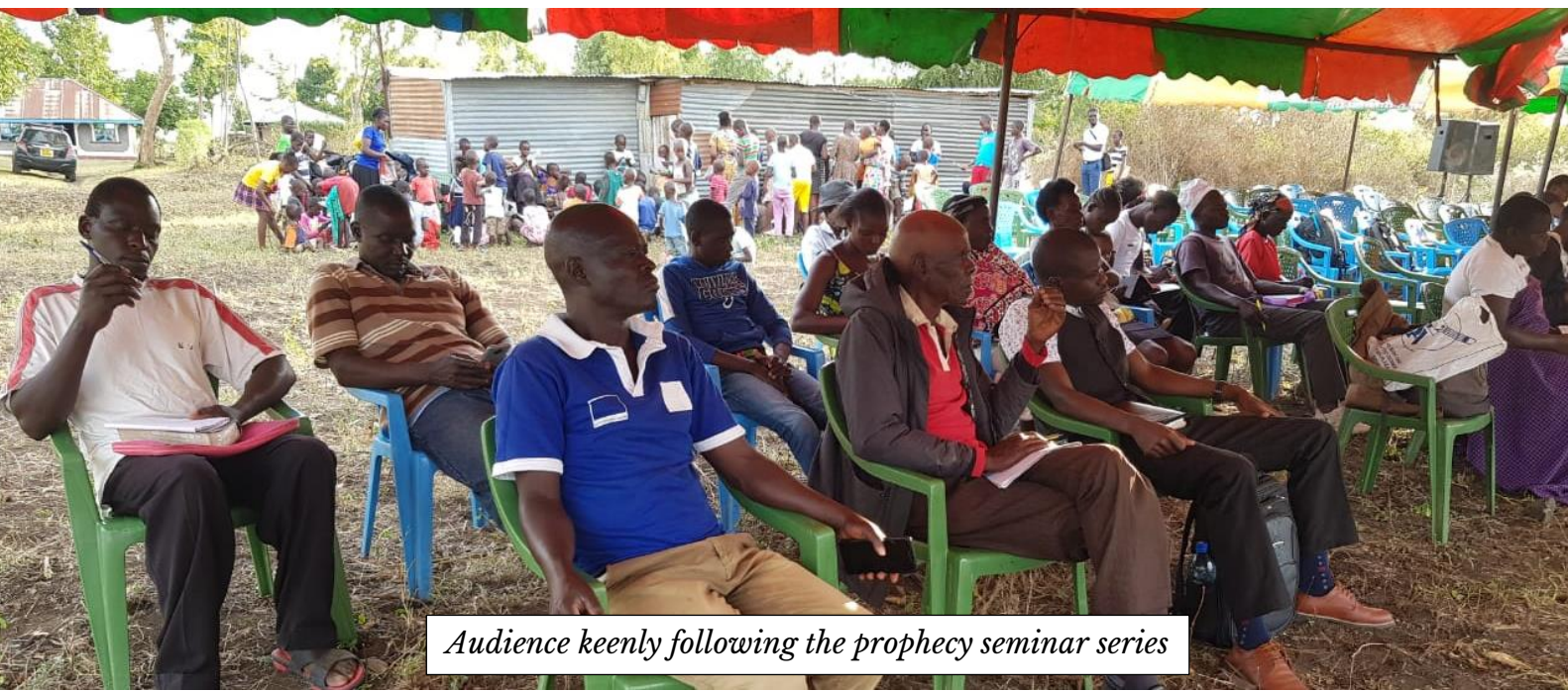
Audience keenly following the prophecy seminar series