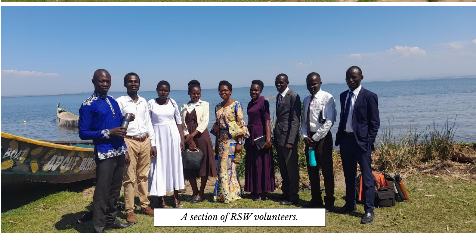
A section of RSW volunteers.