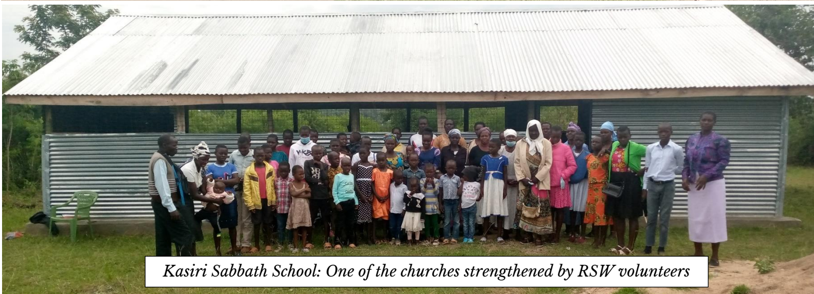
Kasiri Sabbath School: One of the churches strengthened by RSW volunteers