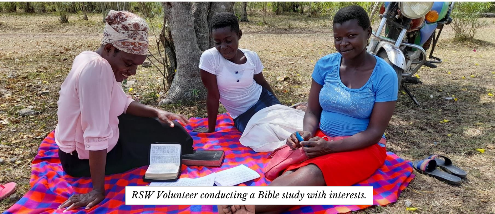
RSW Volunteer conducting a Bible study with interests.