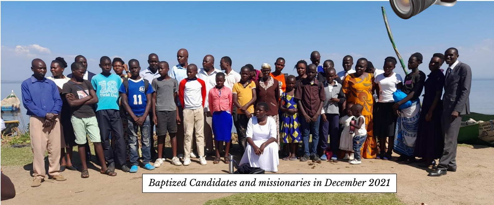
Baptized Candidates and missionaries in December 2021