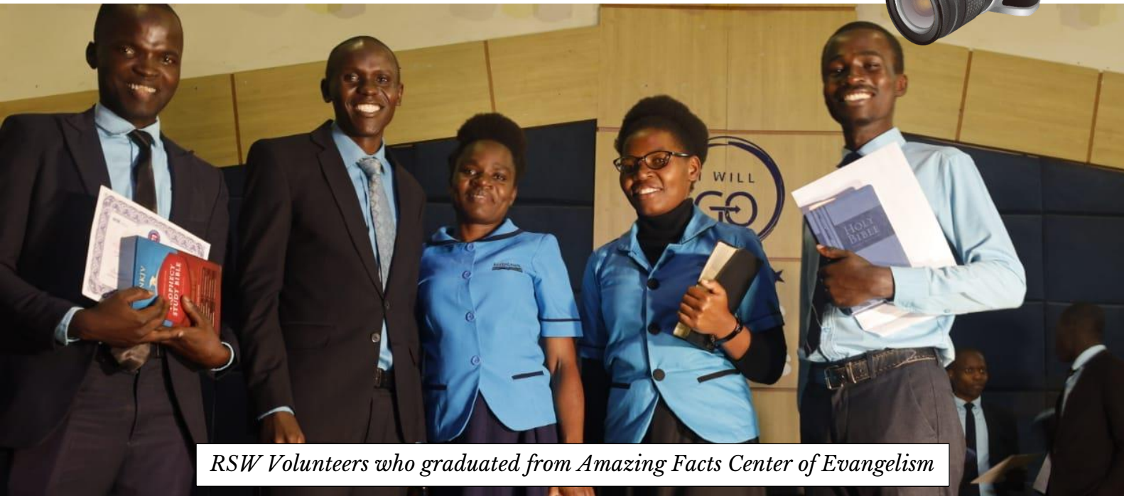
RSW Volunteers who graduated from Amazing Facts Center of Evangelism